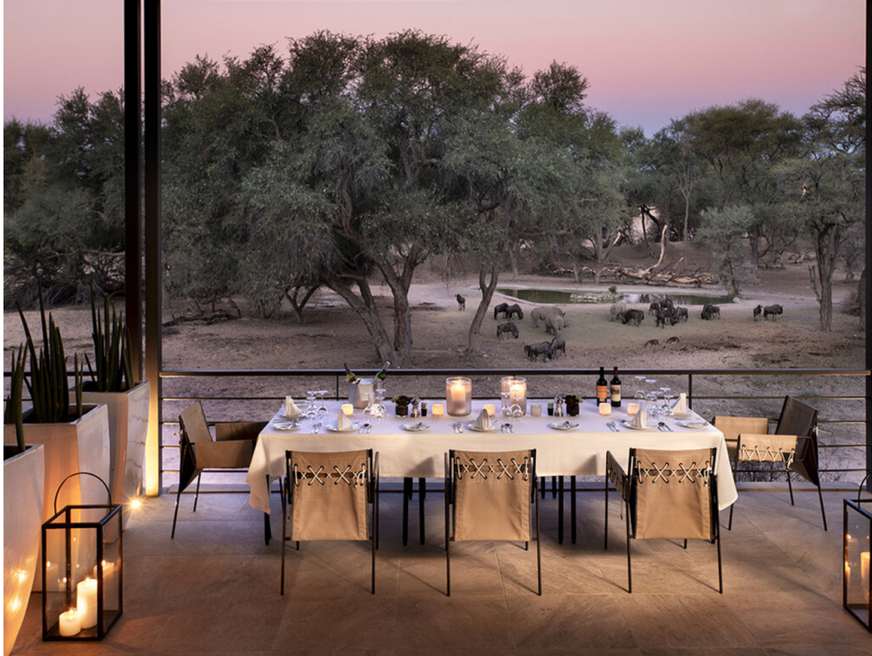
Epako Safari Lodge

With our migratory impulses fettered, our longing for distant horizons shackled by Covid-19, travel is a frequent theme of our dreams. Getting away gains value by virtue of its not being within easy reach, we now consider a voyage's deeper meaning before setting out in 2021.