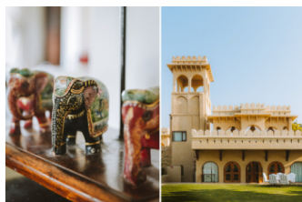
The Value of Craftsmanship: Connecting You to Culture Click here to read