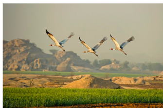
The Call of the Wild Click here to read