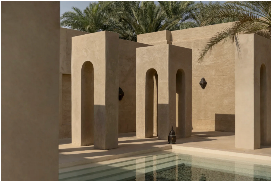
Natelee Cocks/Bab al Shams